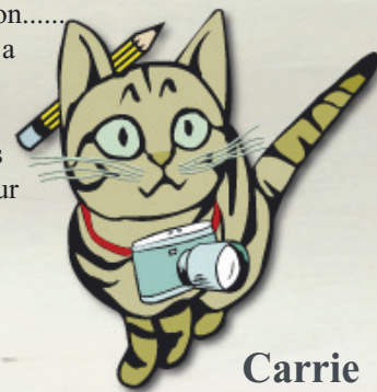
Carrie Cat Reporter extraordinaire

It's a simple and permanent means of identifying your much-loved pet.