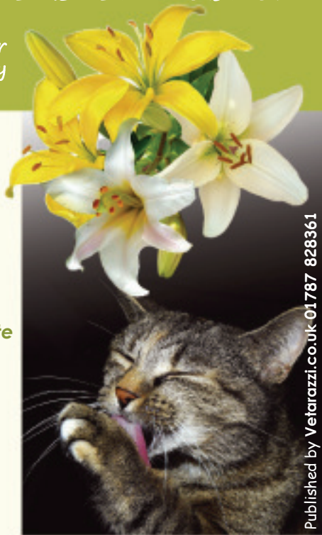
Published by Vetarazzi.co.uk 01787 828361

Lily poisoning can cause acute kidney failure, and sadly in some cases is fatal. The sooner treatment can begin the better. Play it safe and avoid having lilies in your house or garden.